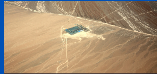
ATACAMA DESERT, CHILE

2009 AES Gener LOS ANDES 20 MW/10 MWH BATTERY CO-LOCATED WITH COAL PLANT